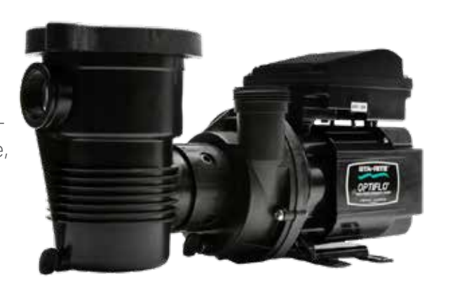
OptiFlo Aboveground Pool Pump

Oh, and it's a summer breeze to maintain. All in all, a waterwise way for aboveground pool owners to remain carefree, and confident well after the regulations take effect.