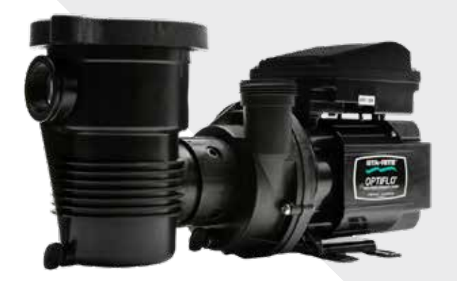
OptiFlo Aboveground Pool Pump

Note: The 3/4 HP OptiFlo, 1.5 HP OptiFlo and all Dynamo pumps represented here are non-compliant products included strictly for comparsion. The new 1.0 THP OptiFlo represents the only series of pumps available for order.