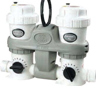
XL PRO System with X-tended Pac Life up to 40,000 Gallons