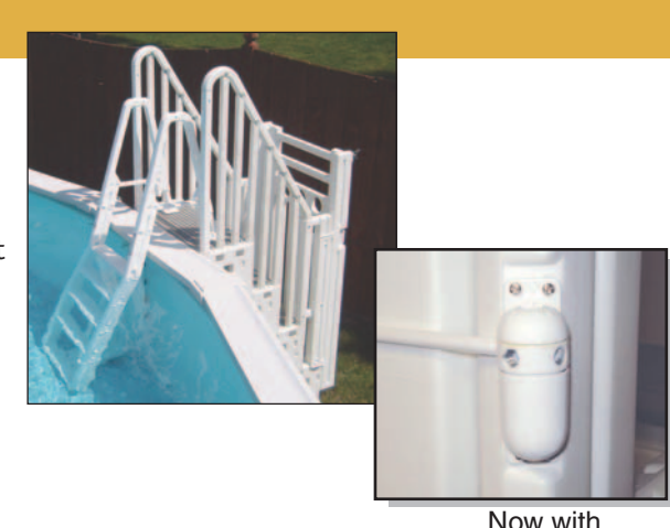
Now with Automatic Gate Closer!