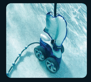
OPTIMUM PERFORMANCE Specifically designed to operate pressure cleaners at optimum efficiency.