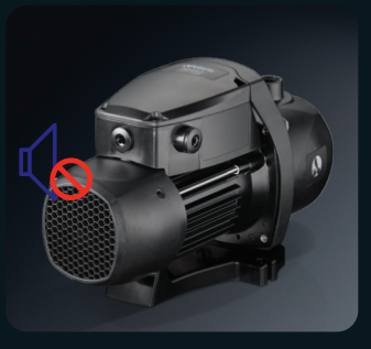
QUIETER OPERATION TEFC motor and innovative fan are designed for quieter operation.