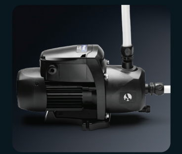
EASY INSTALLATION Includes Quick Connect fittings and easy access to wiring.